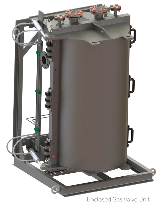
Enclosed Gas Valve Unit HON E-GVU